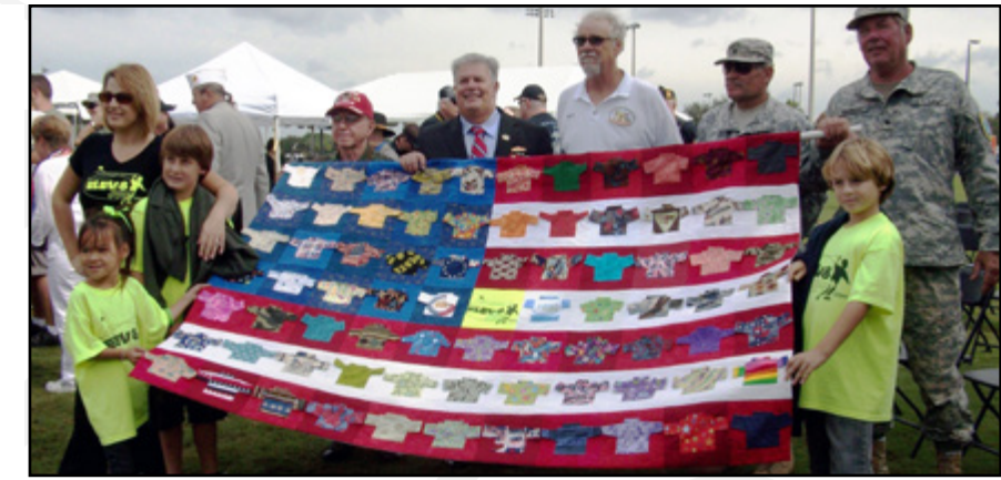
The Quilt of VALOR, created by Elev8Hope and Tykes & Teens and funded through a CHARACTER COUNTS! mini-grant, is displayed during the opening ceremony for the Vietnam Memorial Traveling Wall.