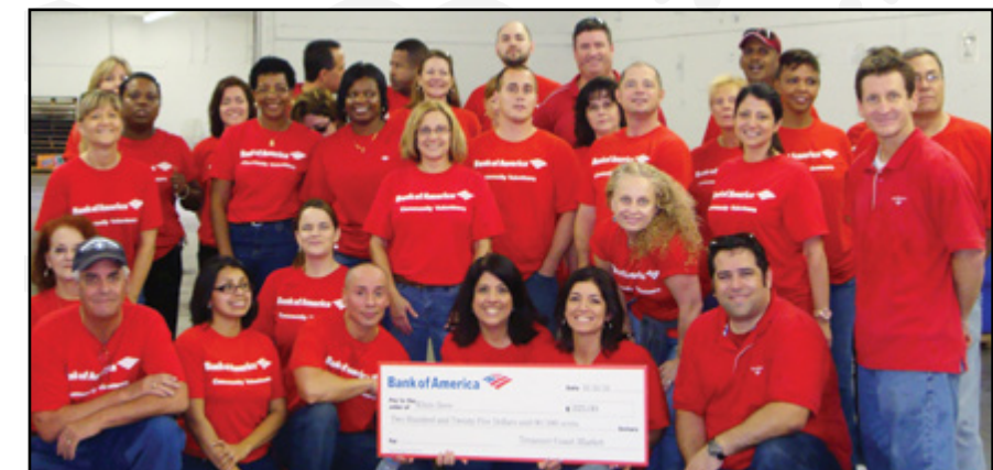
Bank of America present a check to the White Doves Holiday Project before volunteering at the warehouse.