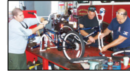
A group of off duty firemen from the Martin County Fire Department volunteer their time building bikes to be distributed through the White Doves Holiday Project.