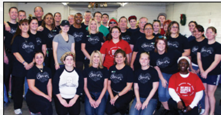
Employees from Publix Super Markets get into the holiday spirit by volunteering their time during the White Doves Holiday Project.