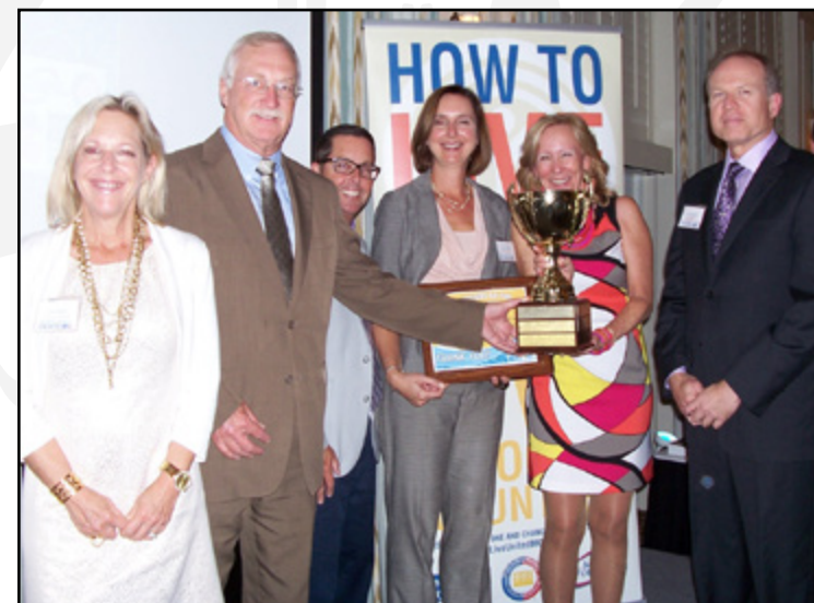
CORPORATE CHAMPIONS - Florida Power & Light