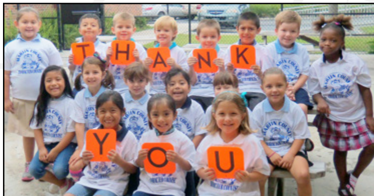
Kindergarten students at Pinewood Elementary School proudly wear their brand new CHARACTER COUNTS! T-shirts.

While every attempt has been made to ensure the accuracy of this listing, we apologize for any errors or omissions. Please advise us of any corrections so we can recognize you next year.